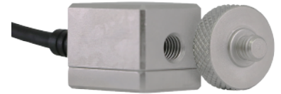
External Sensor Magnet/Stud Mount