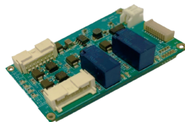
DI/DO Control Board PCB