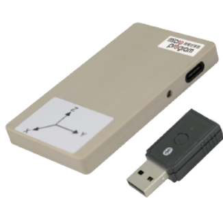
Battery Type (Fully Wireless)

Used to detect vibration signals of equipment to further determine whether or not the equipment is abnormal. It includes a MEMS accelerometer combined with a microcontroller unit (MCU) and can be installed at any position by freely choosing between the wireless, wired and external types according to different needs; analysis algorithm can also be written into the sensors and be outputted through DI/O to be received by equipment controllers. It can be applied on the machines in manufacturing processes for industries of semiconductors and optoelectronics, such as the equipment that may have reduced yield or shutdown due to vibrations or produce abnormal vibrations due to malfunctions, including robot arms, motors, pumps, etc.