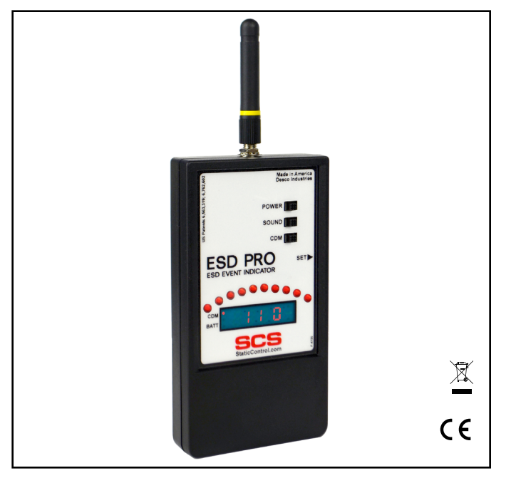
Figure 1. SCS CTM082 ESD Pro - ESD Event Indicator